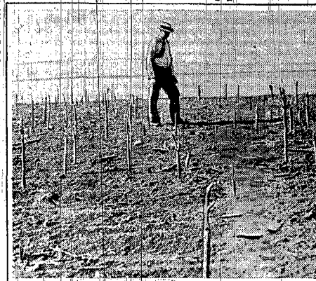
This picture taken near Hamill, S. D., shows what remained of a corn field after the grasshopper swarms had left. Farmers in South Dakota, Nebraska and Iowa have resorted to poison and prayer for protection against the hopper plague. Large sections in all three states have been denuded as this by the invasion.